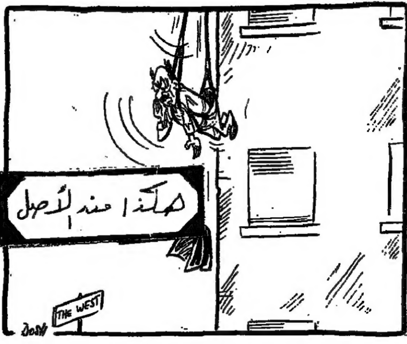
"Prepare me a soft landing or I'll change my mind!"

Indeed, being unable to master high-speed warfare, the Egyptian army even lost a great part of its former defensive capacity. There can be little doubt that the Egyptian Command came to realize these unpleasant facts. The faint was, of course, largely that of the Egyptians (which they are even less able to admit), since they